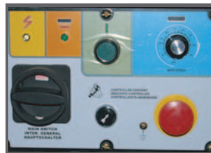
WE275DSV Control Panel