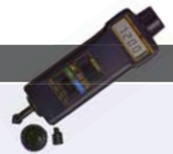
Photo & Contact Type. 2 in one Wide range, 0.5 to 100,000rpm High accuracy, Intelligent function